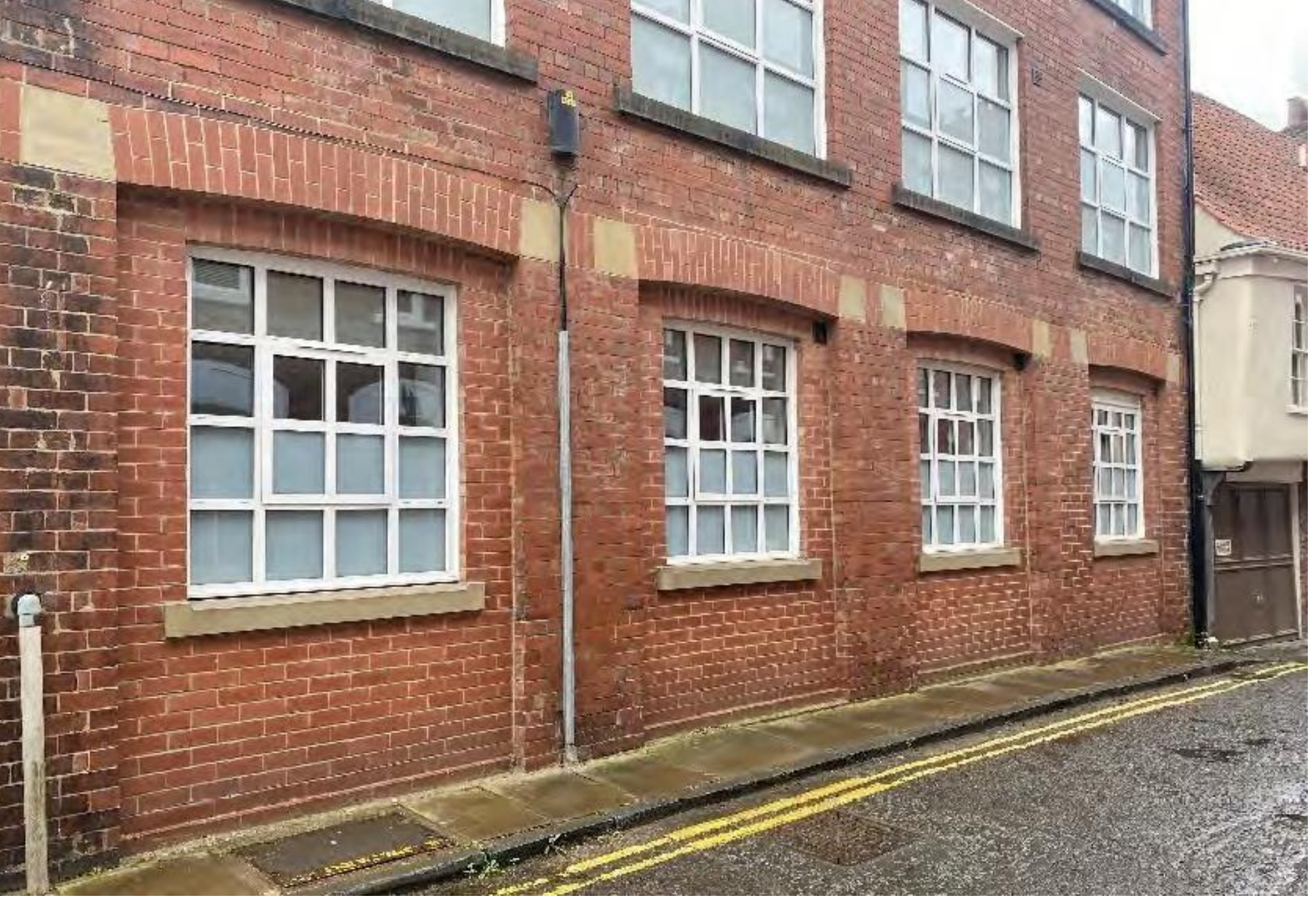
Planning Committee B Meeting - 16 December 2024