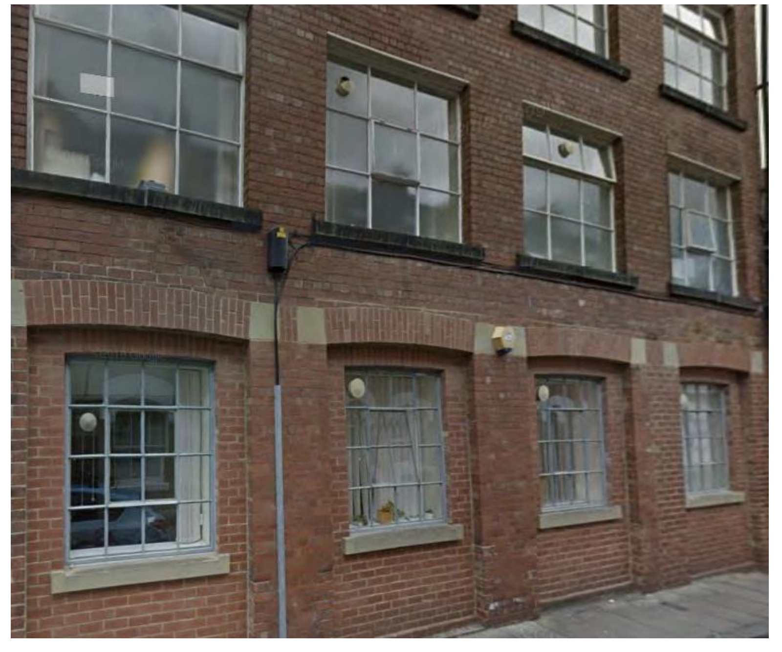
Planning Committee B Meeting - 16 December 2024